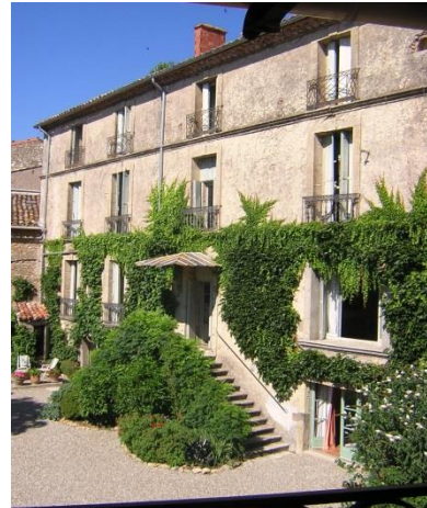
View from Green Room Apartment