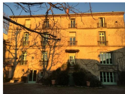
View from the courtyard