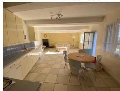
Gatehouse Living Room