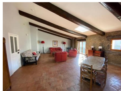
Green Room Apartment