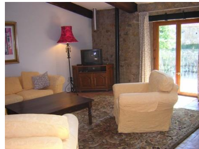
Green Room Apartment