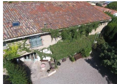
Rehearsal Room Block